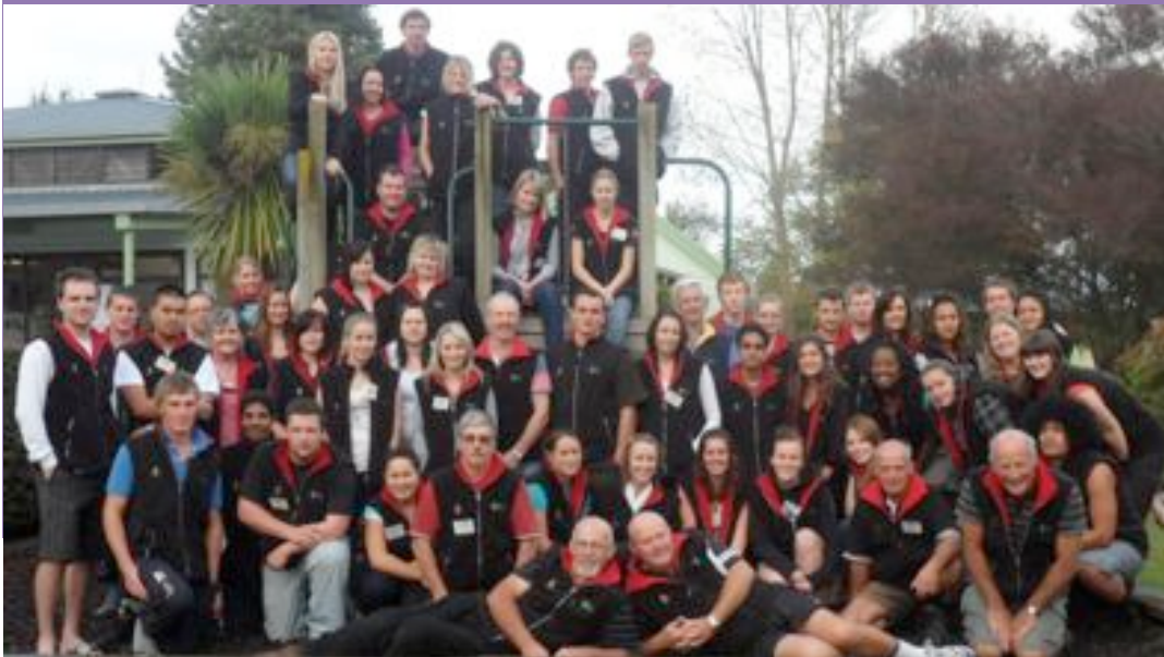
Above: 2011 RYLA awardees.

The week-long RYLA leadership camp was held at Epworth Retreat, Karapiro, run by the 2010/11 District RYLA Committee.