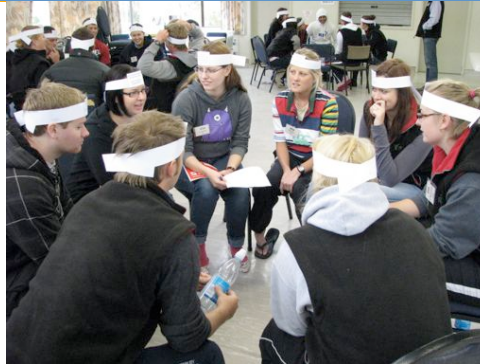
Above: An interactive communication exercise, experiencing first hand the barriers to effective communication, created by assumptions and putting people in to boxes.