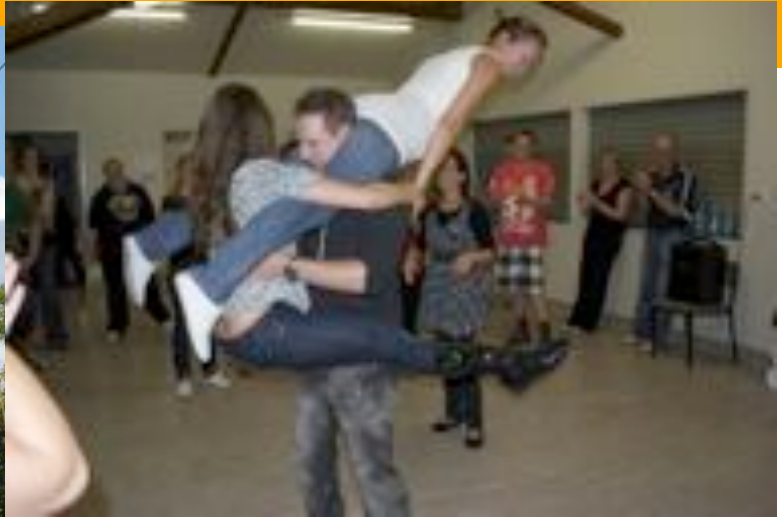
Above: 'The Helicopter' bravely attempted during Rock n Roll night.