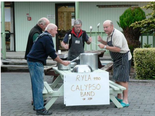
Below: An innovative wake up call by the kitchen team on the last morning!