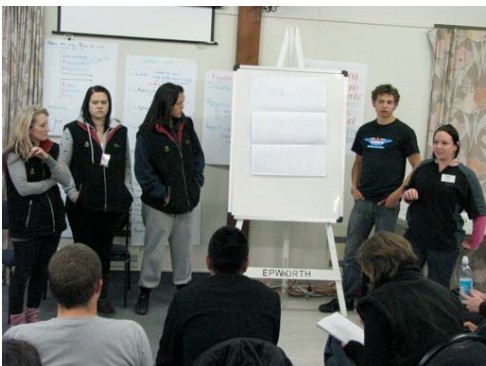
Above and below: Awardees became increasingly comfortable with opportunities for public speaking.