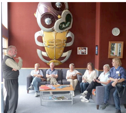
Waikato Sunrise welcomed the RFE group from West Sweden with a Kiwi BBQ at